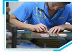
4. PCB QC