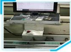
1. Computer programming