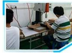
8. Ultrasonic Plastic welding machine