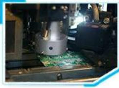
2. Fixing IC and resistors