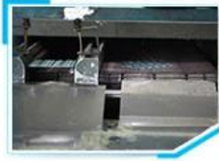
3. Electronic oven