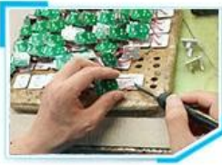
6. Repair welding process