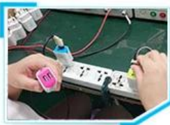
9. Aging test for travel charger