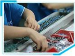
5. Plug in components and parts