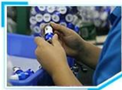
11. Outlook checking