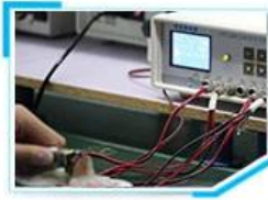
7. PCB board function testing